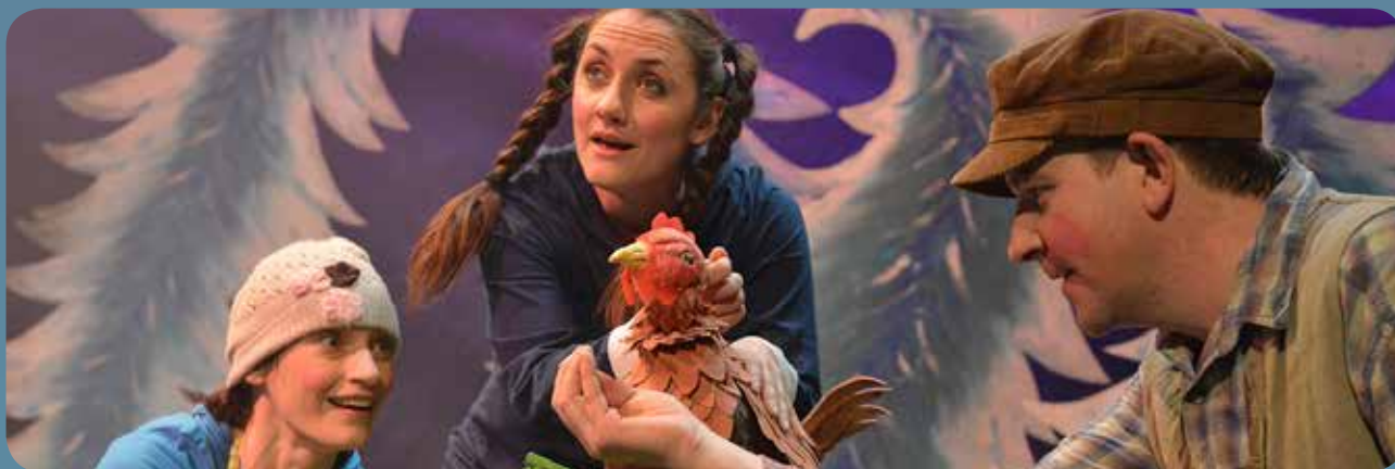
Image of last years Guildhall Theatre Christmas show

A magical tale of family, friendship and one potty professor's Christmas miracle.